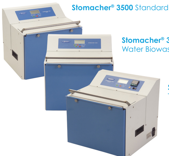
Stomacher® 3500 Standard

3 year warranty and 10 year service support