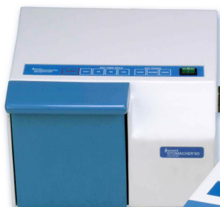
Stomacher® 80 Biomaster