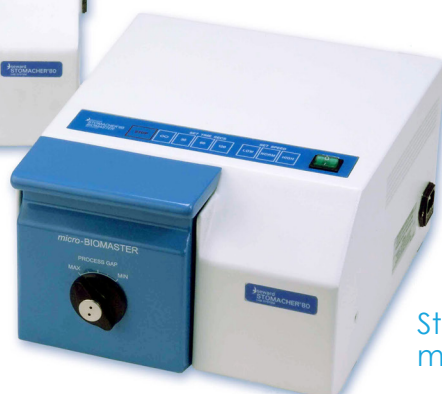
Stomacher® 80 microBiomaster